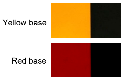
【Test of concealment rate】